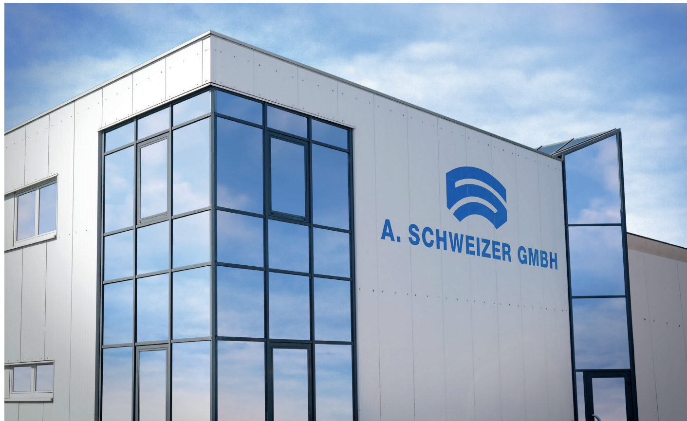
SCHWEIZER headquarters in Forchheim / Germany with a production area of 5500 m².