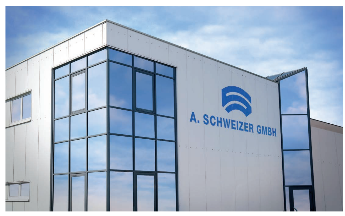
SCHWEIZER headquarters in Forchheim / Germany with a production area of 5500 m<sup>2</sup>.